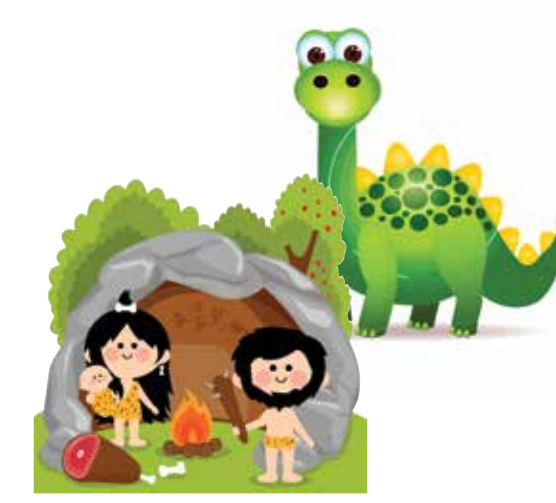
Is your furnace prehistoric? Later 5 VID: For Final 9!

'Tis the season for home improvement! Plumbing, heating or bathroom remodeling